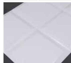
White Raised Profile 200mm x 200mm